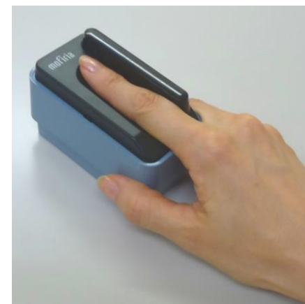
Example of usage

FVA-U4ST includes authentication (matching) feature and supports two types of authentication processes, in device and on server.